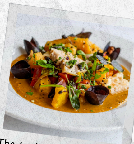
The typical "bouillabaisse"

In this guide, we're gathering all the best recommendations for your DiscoverEU trip. Leaf through it and find your perfect combo!